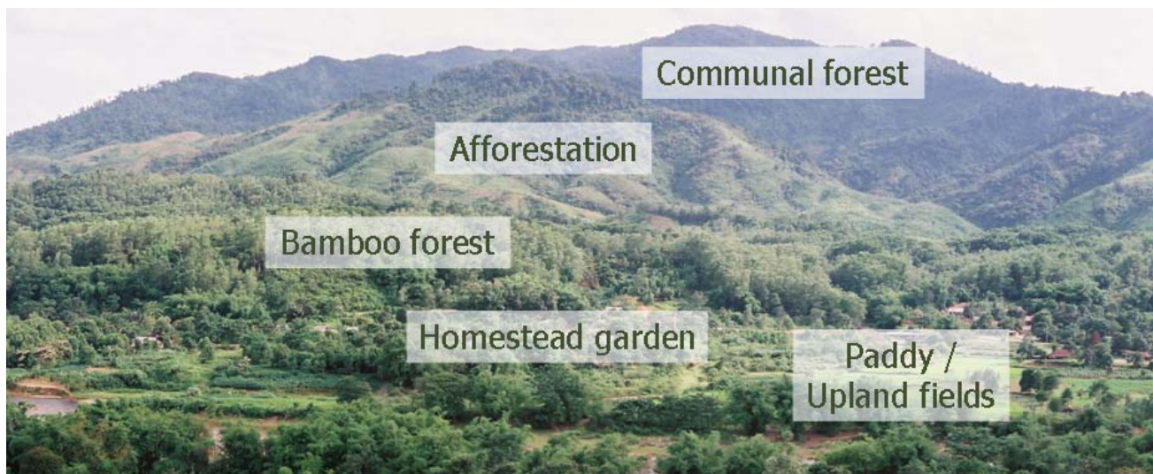
Fig. 3. Landscape of Pa Rinh Settlement