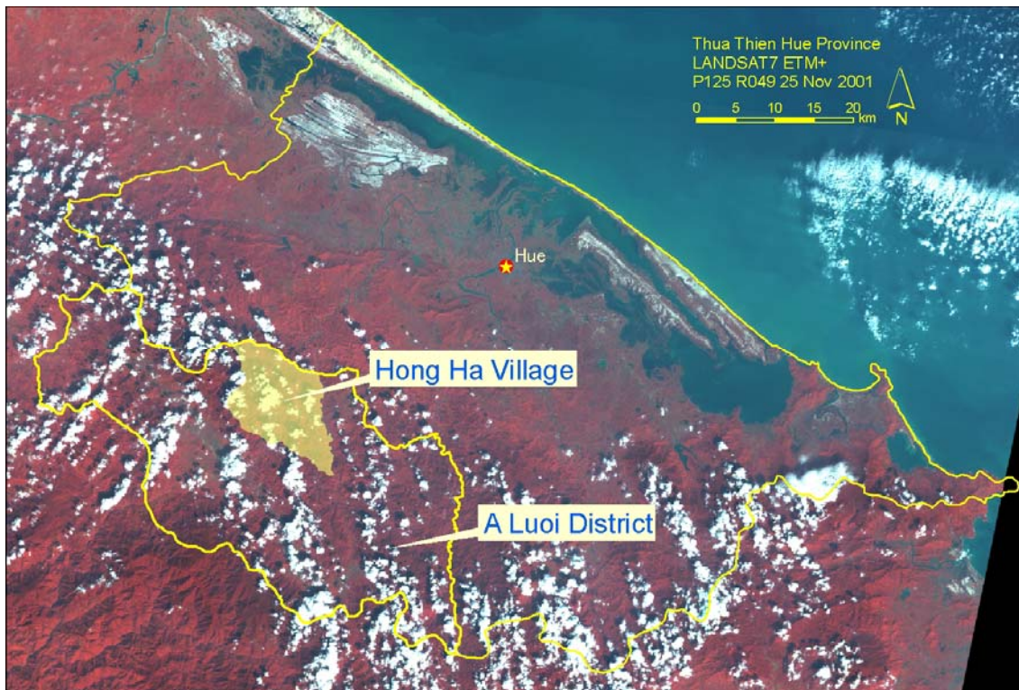
Fig. 1. Location of the Study Area

The primary research site is set to Hong Ha Village in A Luoi District, Thua Thien Hue Province (Fig. 1). The province expands around the historical city of Hue for a total area of 5,050 km 2 with population of 1.1 million. A Luoi has the largest area among nine districts in the province, stretching in the mountain range bordering Laos. Hong Ha lies adjacent to the northern boundary of the district and is accessible from Hue city in approximately one hour by highway 49.